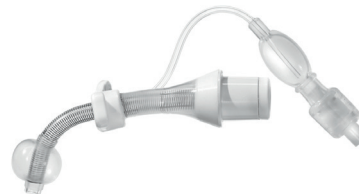
REF 373 with H 2 O Cuff, proximal longer

Standard tubes and length variants (C-Variants) for REF 370 / REF 371 / REF 372 / REF 373