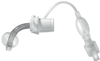
REF 372 with H 2 O Cuff