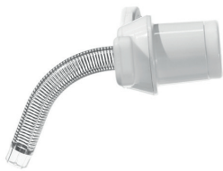
REF 370 without H 2 O Cuff